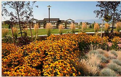
Maintaining Wolf Ranch

Wolf Ranch is located in the Upper Cottonwood Creek Metropolitan Districts which operate with the Old Ranch Metropolitan District pursuant to an intergovernmental agreement among the Districts.